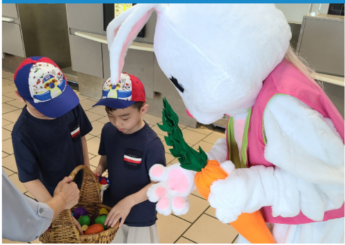
The Easter Bunny made a special visit to the Guam Airport and surprised departing passengers with treats.