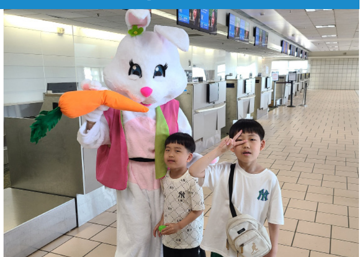
Two young passengers pose with the Easter Bunny at the Guam Airport on April 5, 2023.