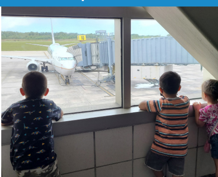
Headstart students of Adacao Elementary School take a moment before boarding a United Airlines aircraft. The tour included a visit to the tower, the U.S. Customs & Border Protection Hall, baggage claim, Guam Customs & Quarantine, and passenger screening conducted by TSA.